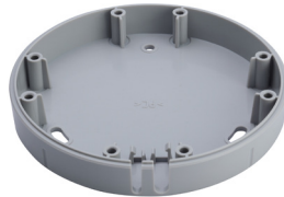
Plate with threaded screw holes for ceiling mounting